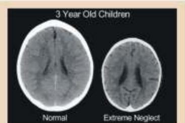
These images illustrate the negative impact of neglect on the developing brain. In the CT scan on the left is an image from a healthy three-year-old with an average head: size (50th percentile).The image on the right is from a three-year-old child suffering from severe sensory-deprivation neglect. This child's brain is significantly smaller than average (3rd percentile) and has enlarged ventricles and cortical atrophy.